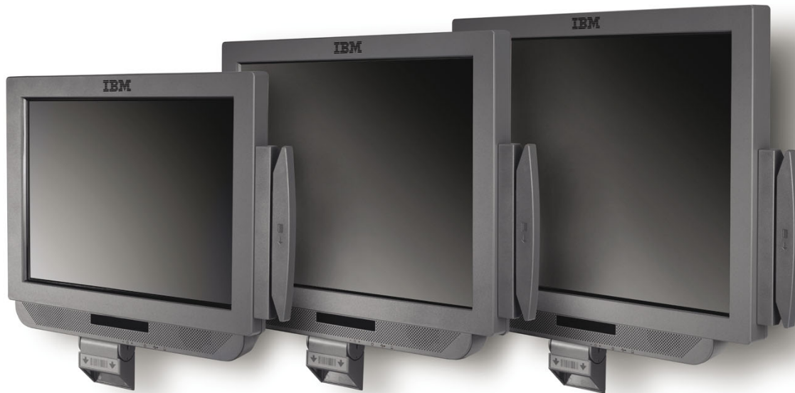
IBM AnyPlace Kiosk 15", 17" and 19" models with dual core AMD processors; 15" entry-level model now available

AnyPlace Kiosk self-service solutions are easy to install and can be readily customised to fit almost any environment. The sleek flat panel touch screen – now available in 15", 17" and 19" sizes for the performance units – incorporates high-performance Mobile AMD Turion dual-core processors that support leading-edge applications. AMD Turion is an advanced dual-core processor uniquely optimised for multi-tasking and rich media applications. The entry-level models incorporate the Via C7 processor for reliable performance and low power consumption. Dual video display capability delivers an outstanding customer experience for digital signage or second touch screen support and a magnetic stripe reader and scanner option fit seamlessly into this powerful yet low-profile device.